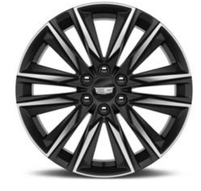
SPORT & SPORT PLATINUM

22" 12-Spoke Polished Alloy with Dark Android Finish