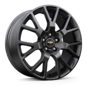
18" Gloss Black Aluminum Wheels Available on LT with Midnight Edition or Sport Edition