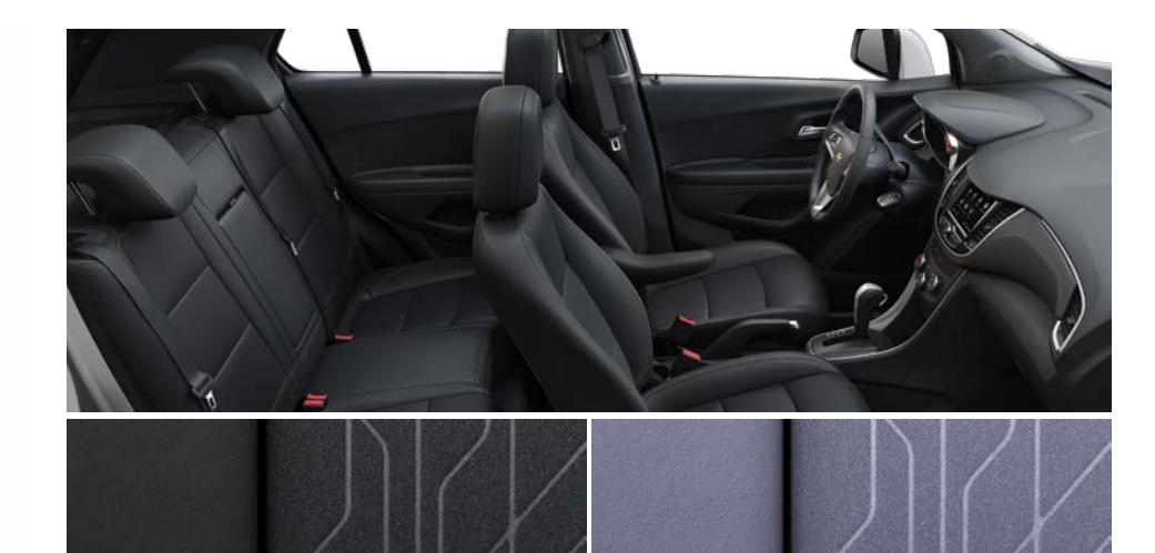
Jet Black Deluxe Cloth/Leatherette Seating Surfaces

Storage - front passenger underseat drawer