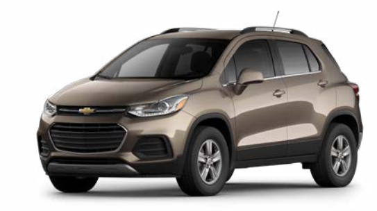
Stone Gray Metallic