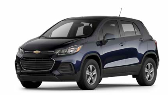
Midnight Blue Metallic