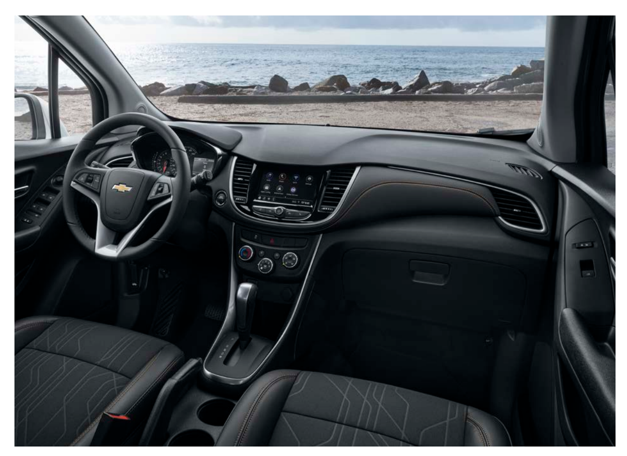
Trax LT interior in Jet Black with available features.

Compact dimensions and maneuverability make it ideal for slipping in and out of tight parking spaces or navigating narrow streets. The new 1.4L Turbo engine offers more horsepower and torque than the previous powerplant. Inside, there's plenty of room for you and four friends. Or take advantage of the fold-flat rear seats when you want to bring some cargo along. Put it all together for a small SUV that's large enough for you to live your biggest life.