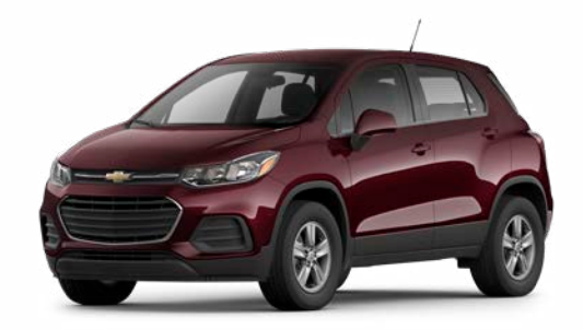
Black Cherry Metallic