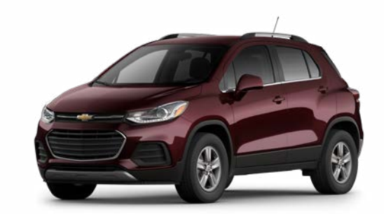
Black Cherry Metallic