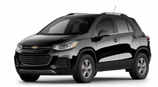
Mosaic Black Metallic