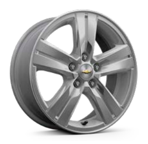
16" Aluminum Wheels Standard on LS