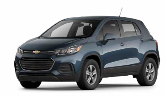
Shadow Gray Metallic