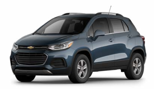
Shadow Gray Metallic