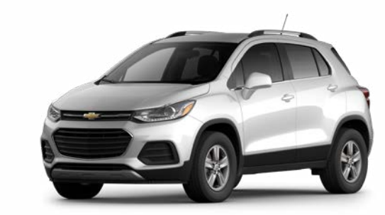
Iridescent Pearl Tricoat1