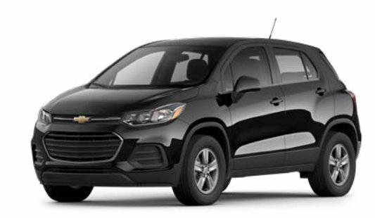
Mosaic Black Metallic