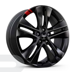
18" Black-Finish Aluminum Wheels with Red Accent Stripes Available on LT with Redline Edition