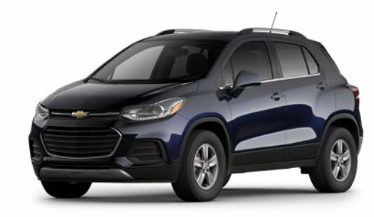
Midnight Blue Metallic