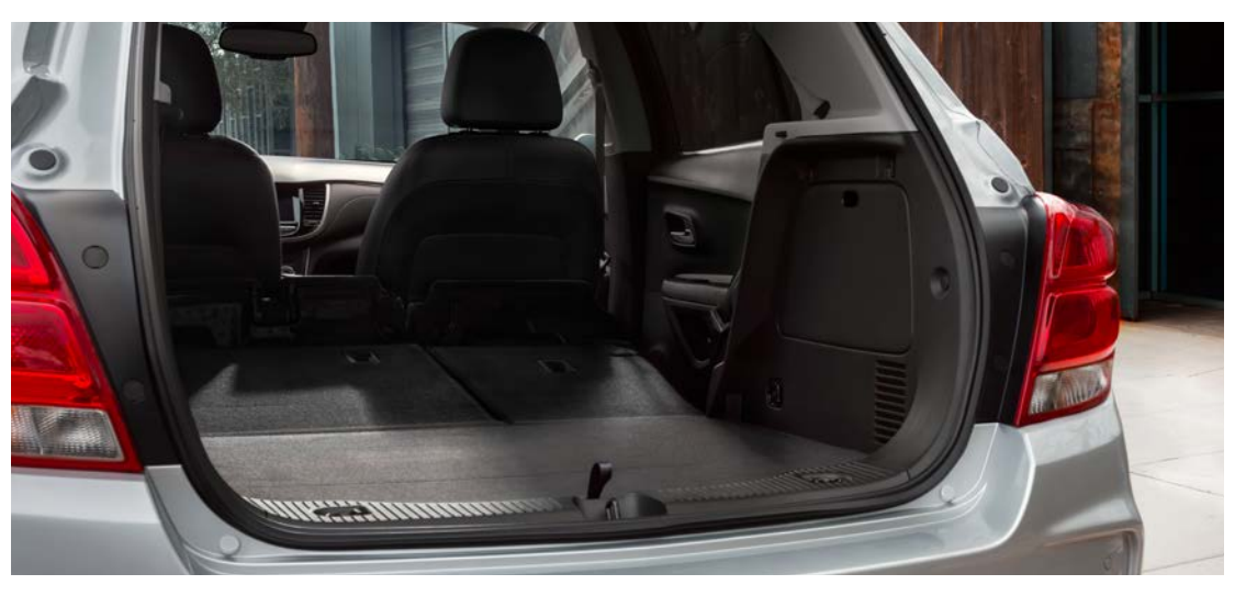
48.4 cubic feet of maximum cargo space?