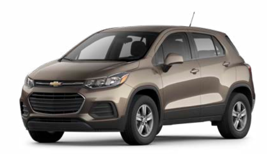
Stone Gray Metallic