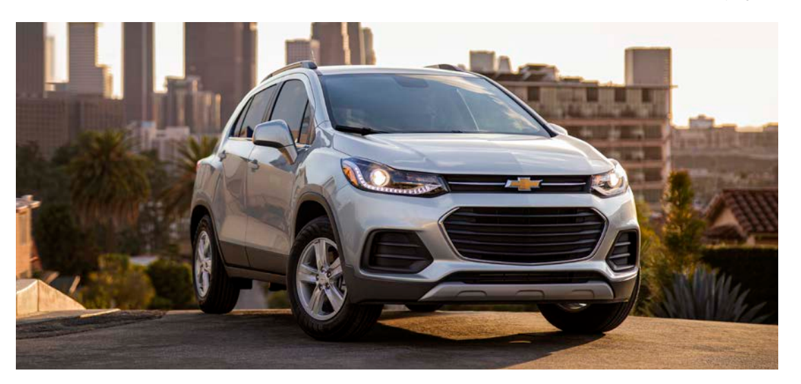
Trax LT in Silver Ice Metallic.

1 EPA-estimated 24 MPG city/32 highway (FWD). EPA-estimated 23 MPG city/30 highway (AWD). 2 Cargo and load capacity limited by weight and distribution. 3 Vehicle user interface is a product of Apple and its terms and privacy statements apply. Requires to an add data plan rates apply. 4 Vehicle user interface is a product of Google and its terms and privacy statements apply. Requires the Android Auto app on Google Play and a compatible Android smartphone. Data plan rates apply. You can check which smartphones are compatible at 9.co/androidauto/requirements. 5 Service varies with conditions and location. Requires active service and paid AT&T data plan. Visit onstar.com for details and limitations. 6 A NOTE ON CHILD SAFETY: Always use seat belts and the correct child restraint for your child's age and size, even with airbags. Even in vehicles equipped with the Passenger Sensing System, children are safer when properly secured in a rear seat in the appropriate infant, child or booster seat. Never place a rear-facing infant restraint in the front seat of any vehicle equipped with an active frontal airbag. See your vehicle Owner's Manual and the child safety seat instructions for more safety information. 7 2015–2022 model years. Government 5-Star Safety Ratings are part of the National Highway Traffic Safety Administration's (NHTSA's) New Car Assessment Program (www.nhtsa.gov).