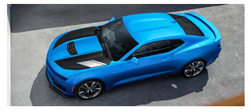
Design Package 3.