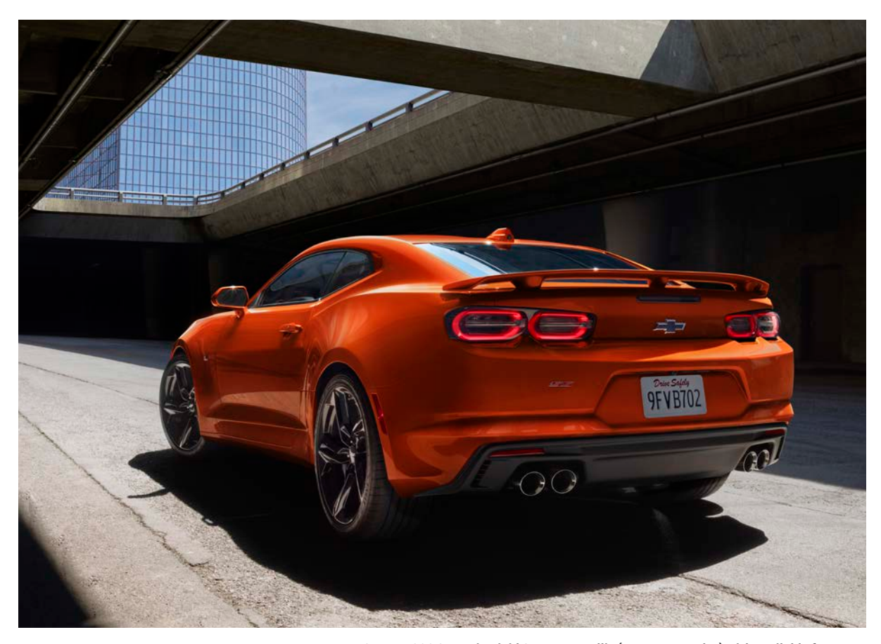
Camaro 2SS Coupe in Vivid Orange Metallic (extra-cost color) with available features.

Like pressing a joy button. The sixthgeneration Camaro is like that and more. Sleek, fast and agile, whether the road is curved or straight. Its architecture is lightweight and ultra-strong, with an advanced 4-wheel independent suspension. Powertrain options range from a 2.0L Turbo all the way up to a 650-horsepower supercharged 6.2L V8. No matter what Camaro you choose, you'll find a beckoning road is a beautiful thing.