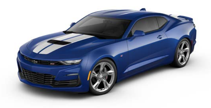
Rally Stripes in White Pearl (shown on 2SS).