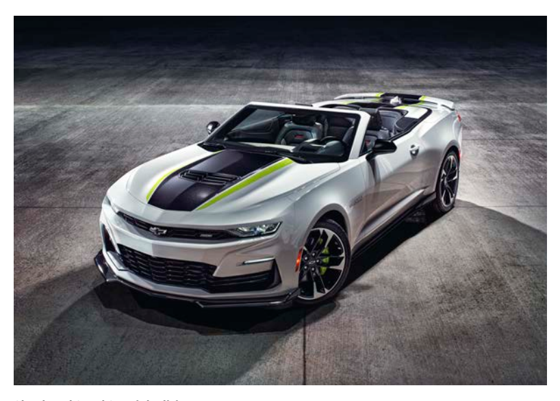
Shock and Steel Special Edition.