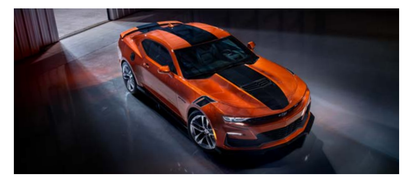
Design Package 2.