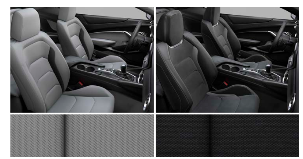
Medium Ash Gray Cloth (shown)

Steering wheel - leather-wrapped flat-bottom with mounted audio, cruise and phone controls