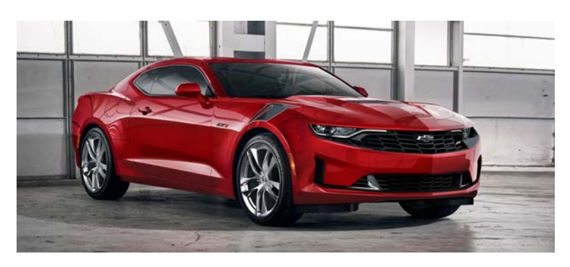
Design Package 1.