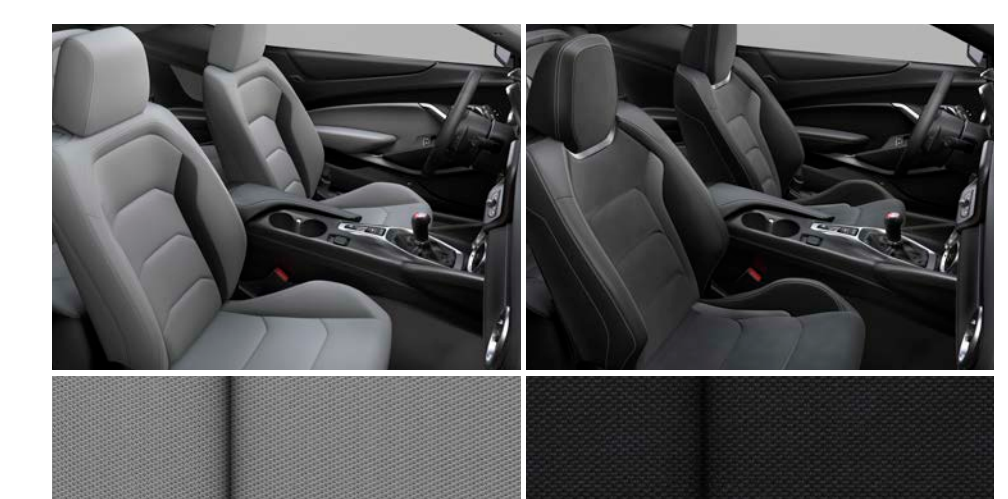
Medium Ash Gray Cloth (shown)

Steering wheel - leather-wrapped flat-bottom with mounted audio, cruise and phone controls