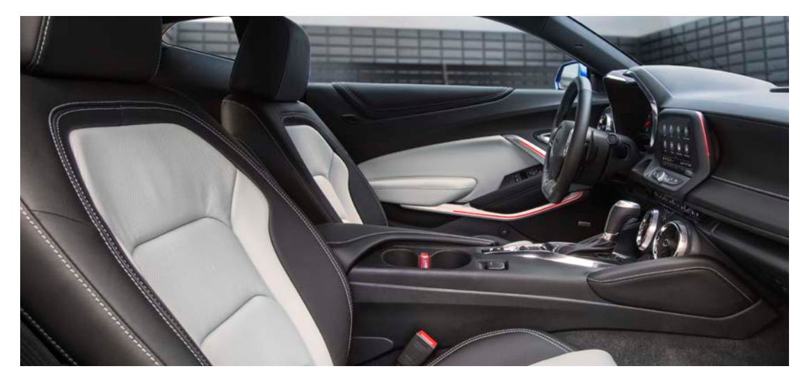
Camaro 3LT interior shown with available Ceramic White Interior Package and other available features.

1 Chevrolet Infotainment System functionality varies by model. Full functionality requires compatible Bluetooth and smartphone, and USB connectivity for some devices. 2 Vehicle user interface is a product of Apple and its terms and privacy statements apply. Requires compatible iPhone and data plan rates apply. 3 Vehicle user interface is a product of Google and its terms and privacy statements apply. To use Android Auto on your car display, you'll need an Android phone running Android 6 or higher, an active data plan, and the Android Auto app. 4 Not compatible with all devices. 5 Service varies with conditions and location. Requires active service and paid AT&T data plan. Visit onstar.com for details and limitations. 6 The system wirelessly charges one compatible mobile device. Some phones have built-in wireless charging technology and others require a special adaptor/back cover. To check for phone or other device compatibility, visit my.chevrolet.com/learn or consult your carrier. 7 Safety or driver assistance features are no substitute for the driver's responsibility to operate the vehicle in a safe manner. Read the vehicle Owner's Manual for important feature limitations and information.