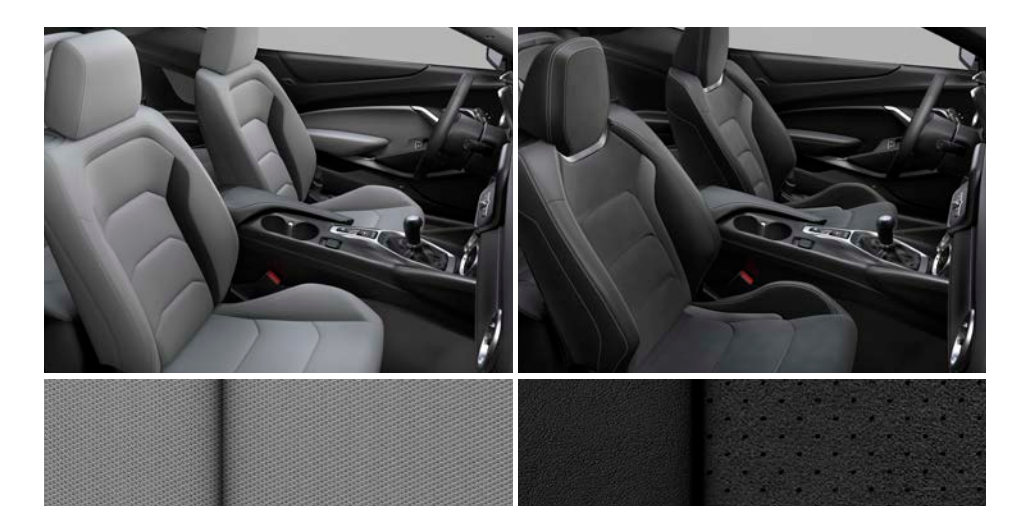
Medium Ash Gray Cloth (shown)

Steering wheel-leather-wrapped flat-bottom with mounted audio, cruise and phone controls