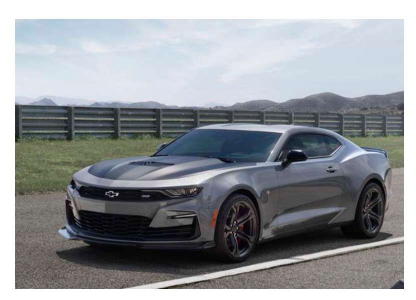
SS 1LE Track Performance Package.