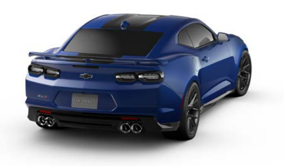
Center Stripe in Black Metallic (shown on ZL1).