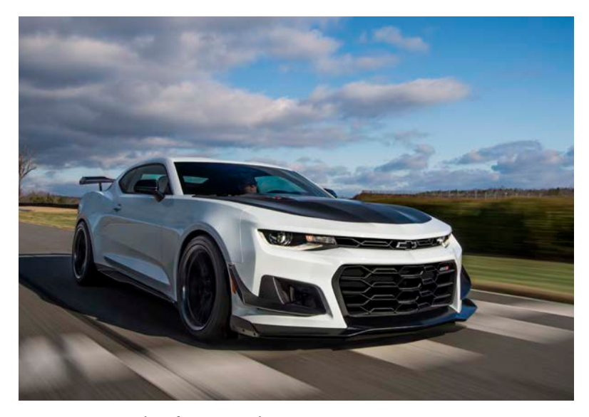
ZL11LE Extreme Track Performance Package.