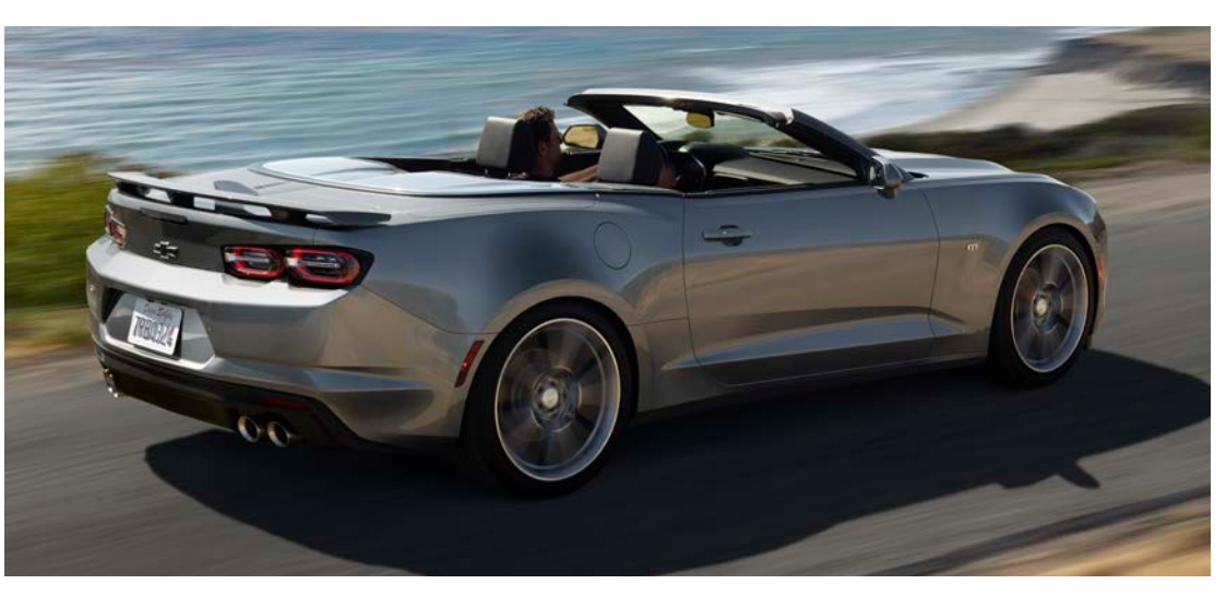
Camaro 3LT Convertible in Sharkskin Metallic with available RS Package and other available features.