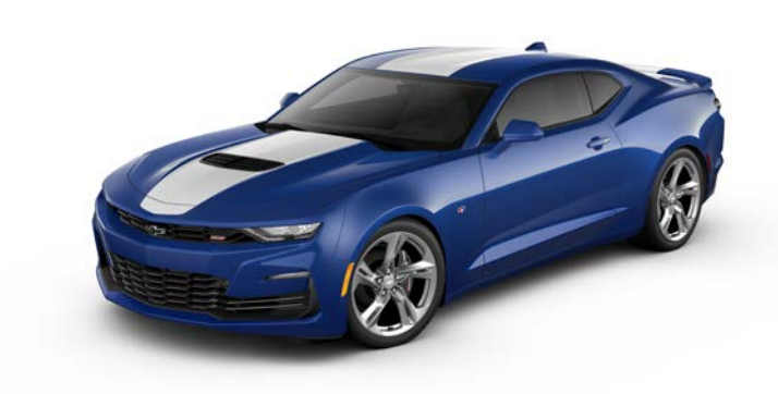
Center Stripe in White Pearl (shown on 2SS).