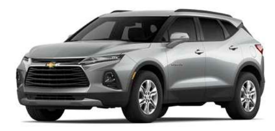
Silver Ice Metallic