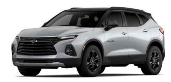
Black/Silver Ice Metallic<sup>3</sup>