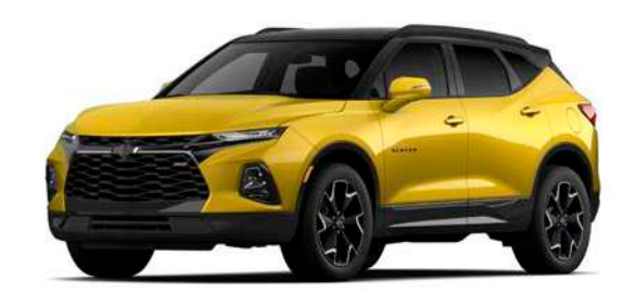
Black/Nitro Yellow Metallic1,2