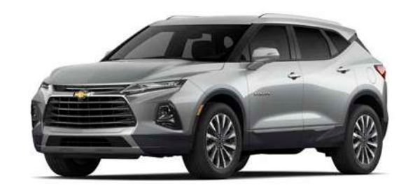
Silver Ice Metallic