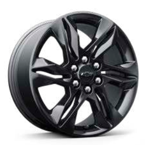
18" Gloss Black-Painted Aluminum Wheels Available on 2LT with Midnight/Sport Edition