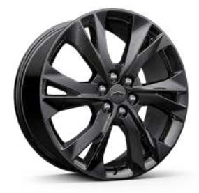
21" Gloss Black-Painted Aluminum Wheels Available on RS

1 Chevrolet Infotainment System functionality varies by model. Full functionality requires compatible Bluetooth and smartphone, and USB connectivity for some devices. 2 Map coverage available in the United States, Puerto Rico and Canada. 3 Safety or driver assistance features are no substitute for the driver's responsibility to operate the vehicle in a safe manner. Read the vehicle Owner's Manual for important feature limitations and information. 4 If you decide to continue service after your trial, your selected subscription plan will automatically renew thereafter. You will be charged at then-current rates. Fees and taxes apply. To cancel you must call SiriusXM at 1-866-635-2349. See SiriusXM Customer Agreement for complete terms at siriusxm.com. All fees and programming subject to change. Certain features require a SiriusXM subscription and the Chevrolet Connected Access plan. See siriusxm.com and onstar.com for details and limitations.