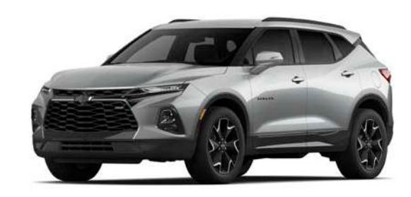
Silver Ice Metallic