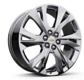
21" Pearl Nickel-Painted Aluminum Wheels Available on Premier

1 Chevrolet Infotainment System functionality varies by model. Full functionality requires compatible Bluetooth and smartphone, and USB connectivity for some devices. 2 Map coverage available in the United States, Puerto Rico and Canada. 3 Safety or driver assistance features are no substitute for the driver's responsibility to operate the vehicle in a safe manner. Read the vehicle Owner's Manual for important feature limitations and information. 4 If you decide to continue service after your trial, your selected subscription plan will automatically renew thereafter. You will be charged at then-current rates. Fees and taxes apply. To cancel you must call SiriusXM at 1-866-635-2349. See SiriusXM Customer Agreement for complete terms at siriusxm.com. All fees and programming subject to change. Certain features require a SiriusXM subscription and the Chevrolet Connected Access plan. See siriusxm.com and onstar.com for details and limitations.