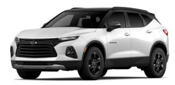
Black/Iridescent Pearl Tricoat<sup>1,2</sup>