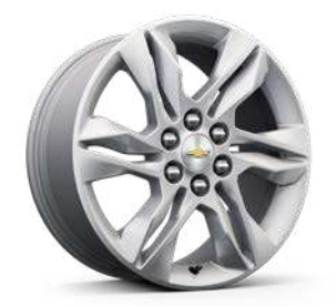
18" Bright Silver-Painted Aluminum Wheels Standard on 2LT