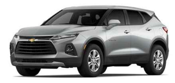
Silver Ice Metallic