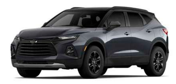
Black/Iron Gray Metallic<sup>2</sup>