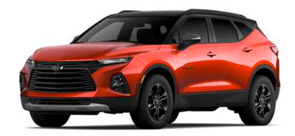
Black/Cayenne Orange Metallic<sup>1,2</sup>