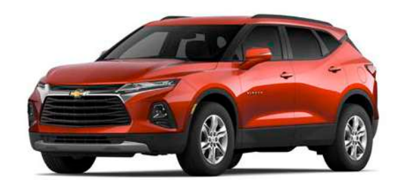
Cayenne Orange Metallic<sup>1</sup>