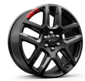
20" Gloss Black-Painted Aluminum Wheels with Red Accents Available on 3LT with Redline Edition

1 Chevrolet Infotainment System functionality varies by model. Full functionality requires compatible Bluetooth and smartphone, and USB connectivity for some devices. 2 Safety or driver assistance features are no substitute for the driver's responsibility to operate the vehicle in a safe manner. Read the vehicle Owner's Manual for important feature limitations and information. 3 If you decide to continue service after your trial, your selected subscription plan will automatically renew thereafter. You will be charged at then-current rates. Fees and taxes apply. To cancel you must call SiriusXM at 1-866-635-2349. See SiriusXM Customer Agreement for complete terms at siriusxm.com. All fees and programming subject to change. 4 Not available with Summit White, Red Hot or Cayenne Orange Metallic exterior colors.