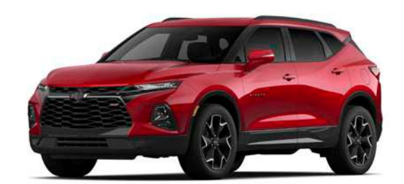
Cherry Red Tintcoat<sup>1</sup>