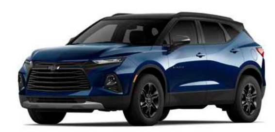
Black/Blue Glow Metallic<sup>2</sup>