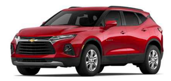
Cherry Red Tintcoat<sup>1</sup>