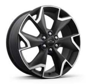
20" Machined-Face Aluminum Wheels with Dark Android-Painted Pockets Standard on RS