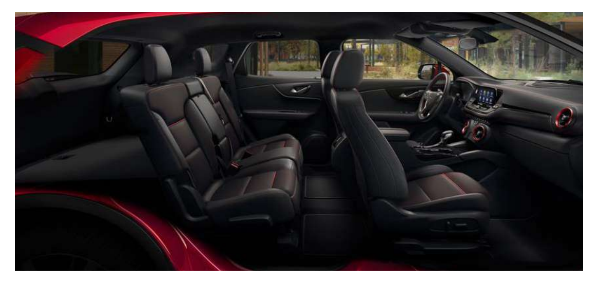
Blazer RS interior in Jet Black with Red accents and available features.

1 Safety or driver assistance features are no substitute for the driver's responsibility to operate the vehicle in a safe manner. Read the vehicle Owner's Manual for important feature limitations and information. 2 With available 3.6L V6 engine and trailering equipment. Maximum trailering ratings are intended for comparison purposes only. Before you buy a vehicle or use it for trailering, carefully review the Trailering section of the Owner's Manual. The trailering capacity of your specific vehicle may vary. The weight of passengers, cargo and options or accessories may reduce the amount you can trailer. 3 Cargo and load capacity limited by weight and distribution. 4 Vehicle user interface is a product of Apple and its terms and privacy statements apply. Requires the Android Auto app on Google Play and a compatible Android smartphone. Data plan rates apply. You can check which smartphones are compatible at g.co/androidauto/requirements.