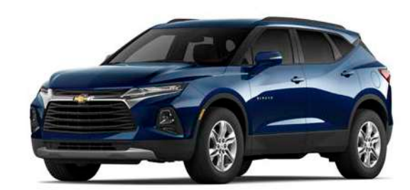
Blue Glow Metallic