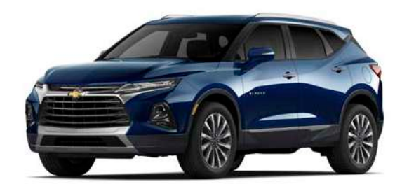
Blue Glow Metallic