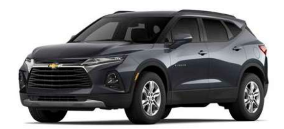
Iron Gray Metallic