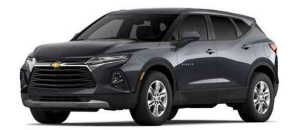
Iron Gray Metallic