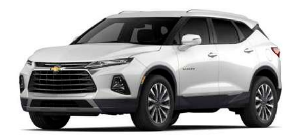
Iridescent Pearl Tricoat<sup>1</sup>