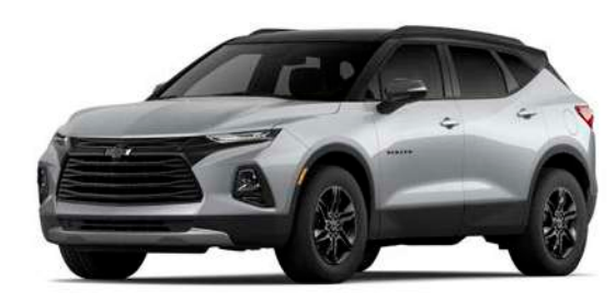
Black/Silver Ice Metallic<sup>3</sup>