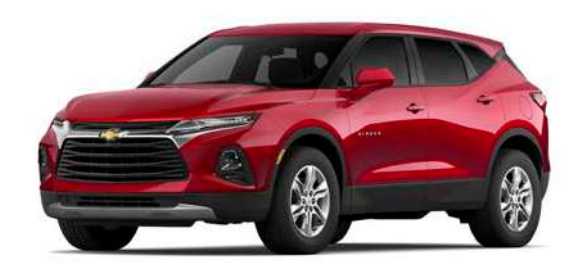
Cherry Red Tintcoat<sup>1</sup>