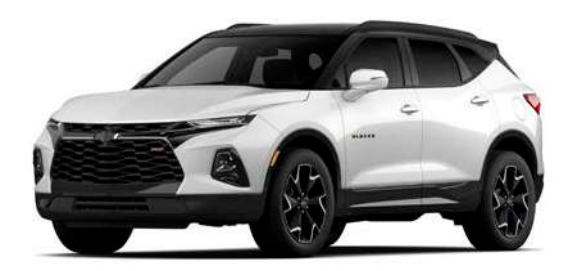
Black/Iridescent Pearl Tricoat<sup>1,2</sup>