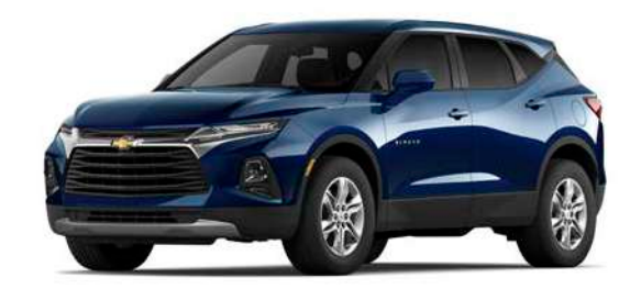
Blue Glow Metallic