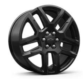
20" Gloss Black-Painted Aluminum Wheels Available on 2LT