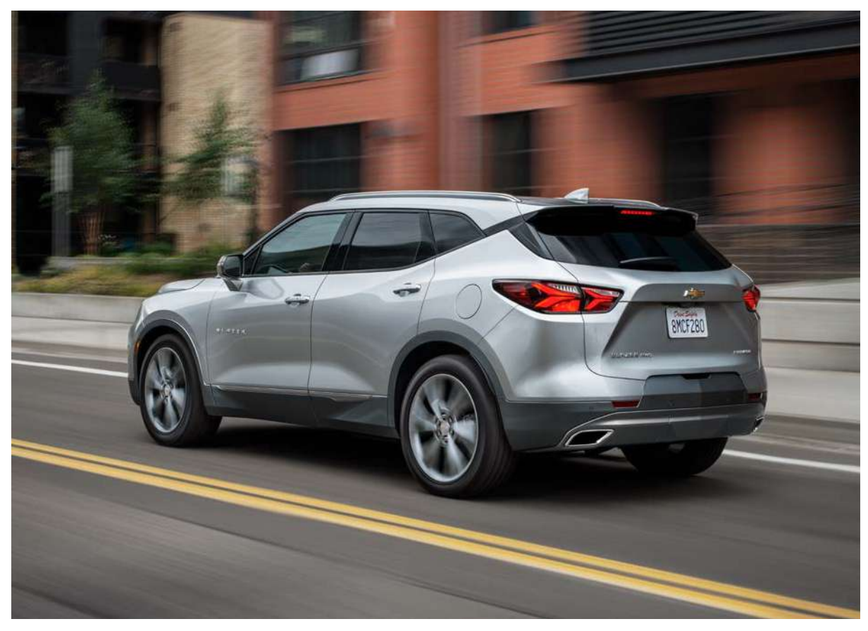
Blazer Premier in Silver Ice Metallic.

Prepare to live your best life in Blazer.