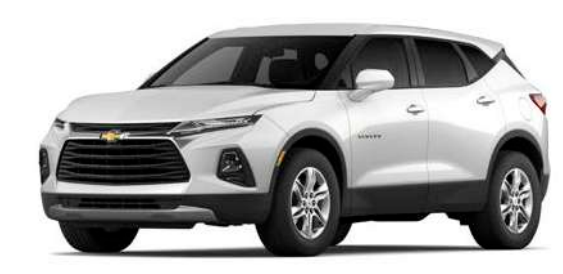
Iridescent Pearl Tricoat<sup>1</sup>