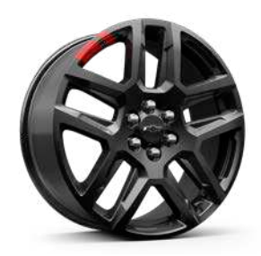
20" Gloss Black-Painted Aluminum Wheels with Red Accents Available on 2LT with Redline Edition