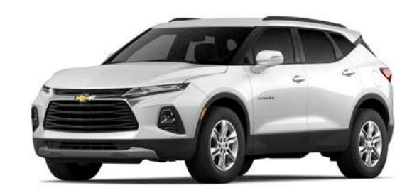
Iridescent Pearl Tricoat<sup>1</sup>