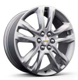
20" Bright Silver-Painted Aluminum Wheels Available on 3LT