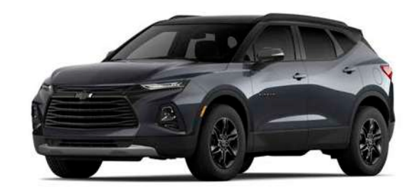
Black/Iron Gray Metallic<sup>2</sup>