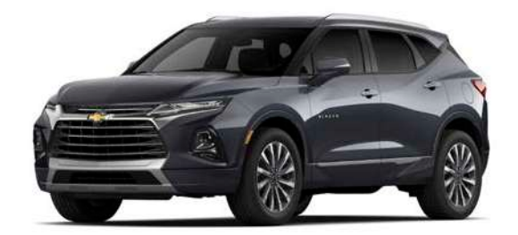
Iron Gray Metallic