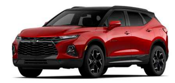
Black/Cherry Red Tintcoat<sup>1,2</sup>