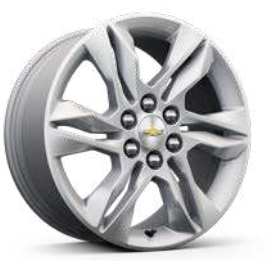
18" Bright Silver-Painted Aluminum Wheels Standard on 3LT