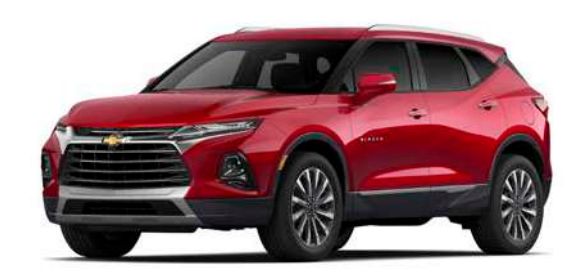
Cherry Red Tintcoat<sup>1</sup>