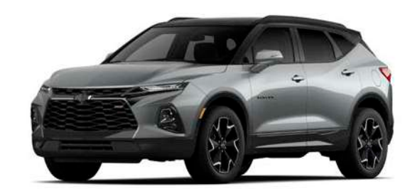
Black/Silver Ice Metallic<sup>2</sup>