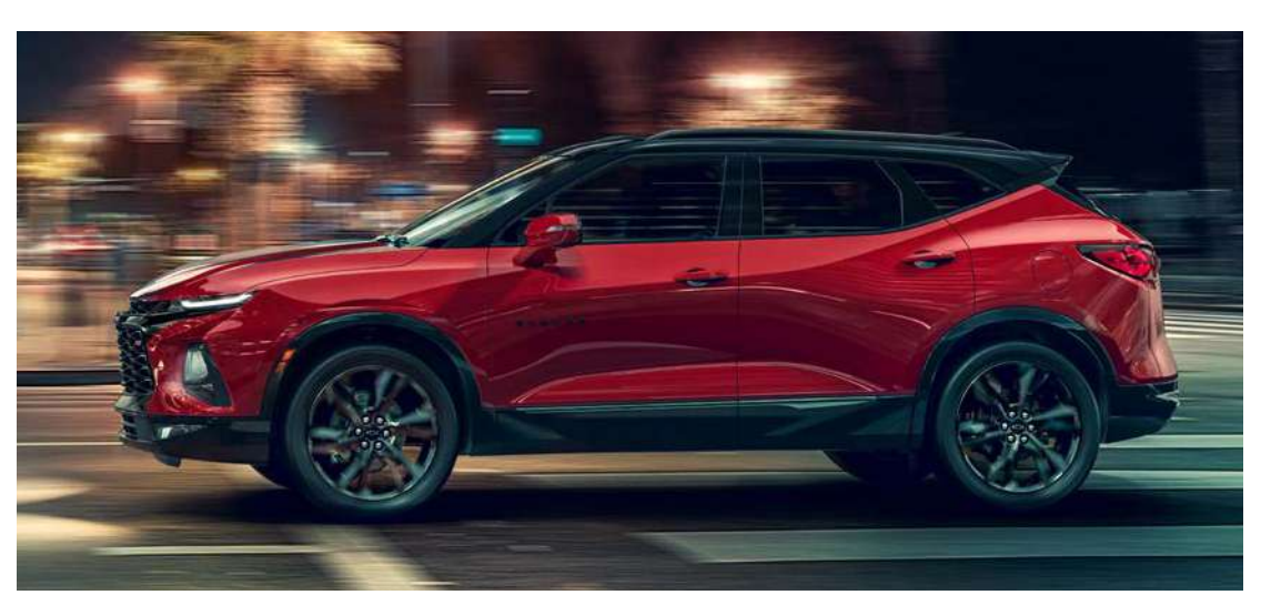
Blazer RS in Red Hot with available features.