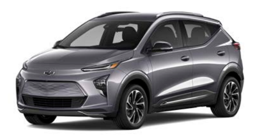
Gray Ghost Metallic