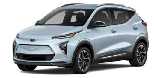
Ice Blue Metallic