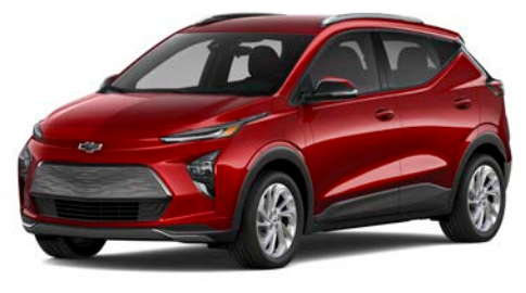
Radiant Red Tintcoat<sup>1</sup>