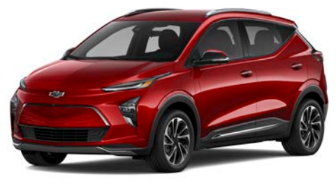
Radiant Red Tintcoat<sup>1</sup>