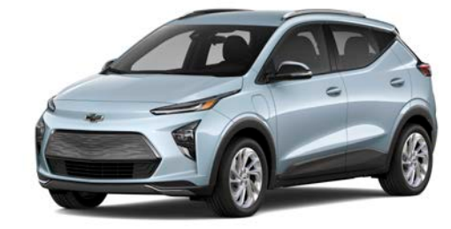
Ice Blue Metallic