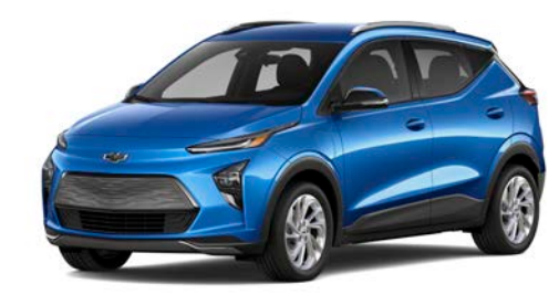
Bright Blue Metallic<sup>1</sup>