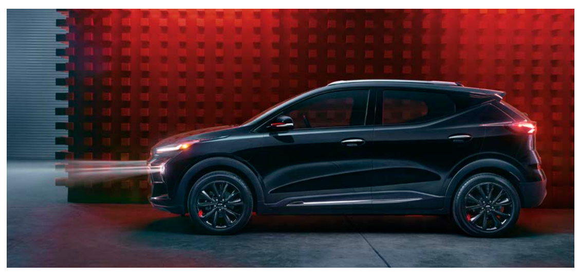
Bolt EUV Premier in Mosaic Black Metallic with available Redline Edition.

Bolt EUV Premier in Radiant Red Tintcoat (extra-cost color).