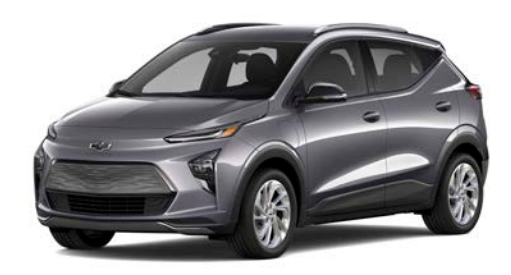
Gray Ghost Metallic