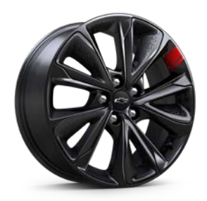
17" Gloss Black-Painted Aluminum Wheels with Red Accents Available on Premier with Redline Edition

1 Feature may be limited when the battery temperatures are extremely cold or hot or when battery is near full charge. Always use the brake pedal when you need to stop immediately. See Owner's Manual for details. 2 Feature may be limited when the battery temperatures are extremely cold or hot or when battery is near full charge. See Owner's Manual for details. 3 Safety or driver assistance features are no substitute for the driver's responsibility to operate the vehicle in a safe manner. Read the vehicle Owner's Manual for important feature limitations and information. 4 Requires available Redline Edition.