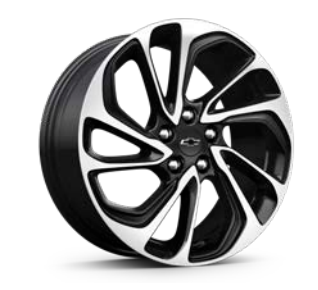
17" Machined-Face Aluminum Wheels with Carbon Flash-Painted Pockets Standard on Premier

Jet Black Perforated Leather-Appointed Seating Surfaces<sup>4</sup>