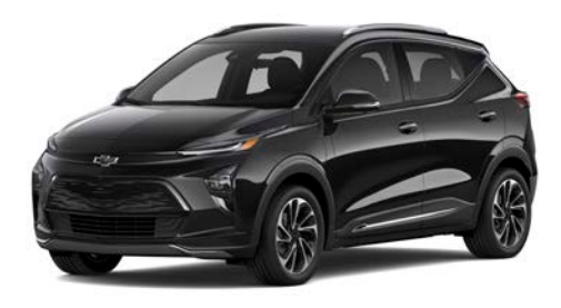
Mosaic Black Metallic