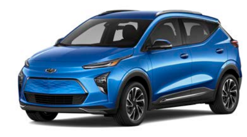
Bright Blue Metallic<sup>1</sup>