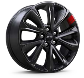
17" Gloss Black-Painted Aluminum Wheels with Red Accents Available on LT with Redline Edition

1 Feature may be limited when the battery temperatures are extremely cold or hot or when battery is near full charge. Always use the brake pedal when you need to stop immediately. See Owner's Manual for details. 2 Feature may be limited when the battery temperatures are extremely cold or hot or when battery is near full charge. See Owner's Manual for details. 3 Safety or driver assistance features are no substitute for the driver's responsibility to operate the vehicle in a safe manner. Read the vehicle Owner's Manual for important feature limitations and information. 4 Chevrolet Infotainment System functionality varies by model. Full functionality requires compatible Bluetooth and smartphone, and USB connectivity for some devices. 5 The system wirelessly charges one compatible mobile device. Some phones have built-in wireless charging technology and others require a special adaptor/back cover. To check for phone or other device compatibility, see my.chevrolet.com/learn or consult your carrier. 6 Requires available Convenience Package. 7 Requires available Redline Edition.